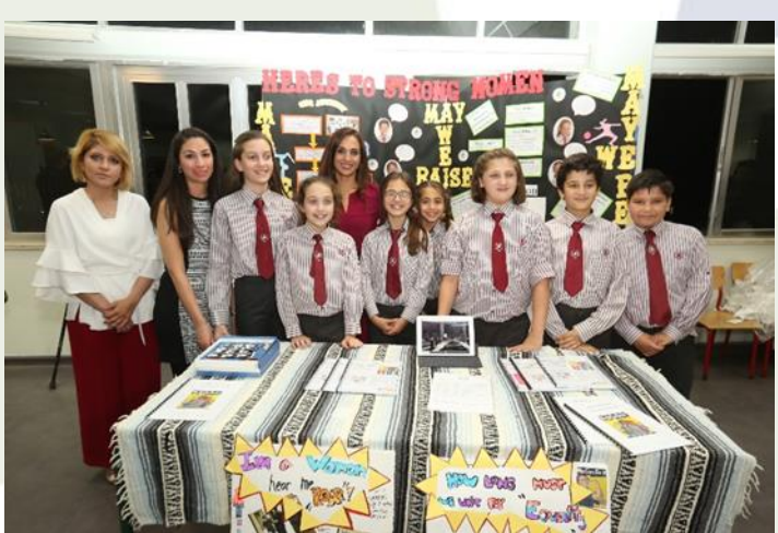
Grades 1-5 Independence Day Celebration