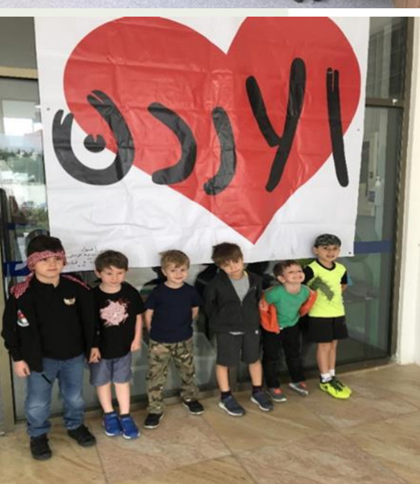
KG2 Unit Presentation