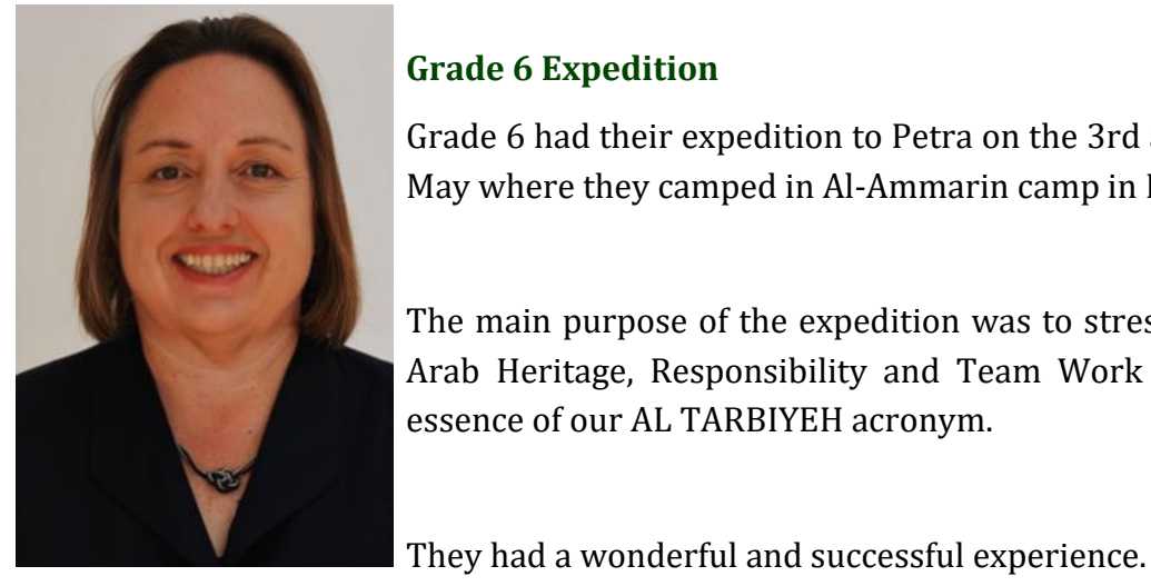
Grade 6 Expedition

Grade 6 had their expedition to Petra on the 3rd and the 10th of May where they camped in Al-Ammarin camp in Petra.